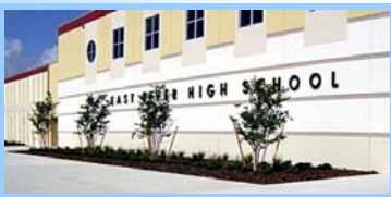
pictured: East River High School

OCPS has been busy prepping several new schools to open their doors for the first time this year. Keene's Crossing Elementary School, East River High School, and Lake Nona High School will kick off their inaugural school term on August 24 th , by which time you'll also be able to add them to your KASS Preferred Schools list.